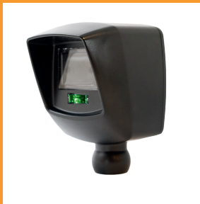
Integrated Sensor Hood