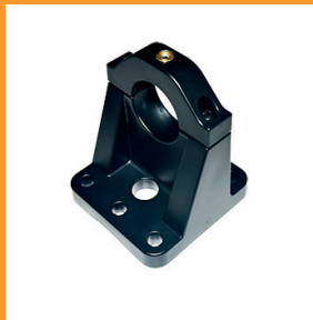
Ball & Socket Mounting Bracket