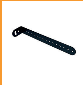
Reflector Extension Bracket