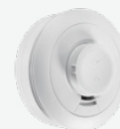
SMKT-900 Smoke/Heat/ Freeze Detector